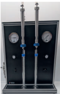
Manual Apparatus available